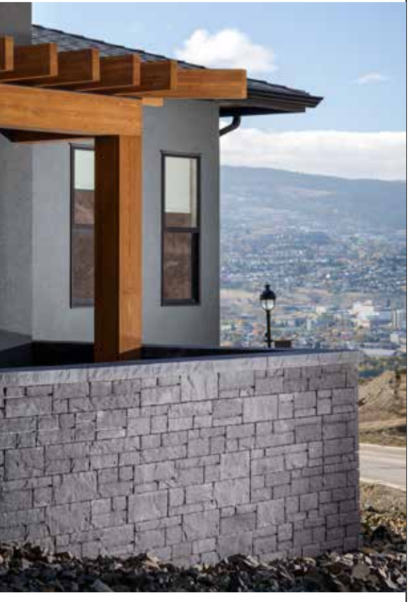
Contact your local Belgard® representative for color options and availability.